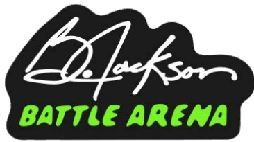
Bo Jackson Battle Arena: Hero Supply by Power